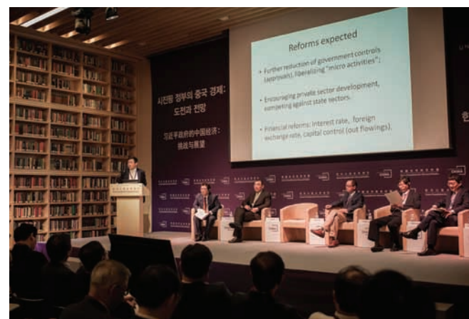
Understanding China Conference