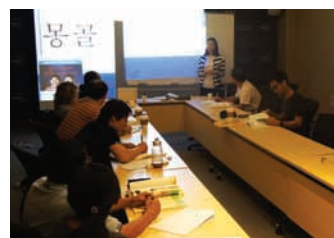
Korean Language Class

Prospectus of the International Scholar Exchange Fellowship for the year 2015-2016 _ 8