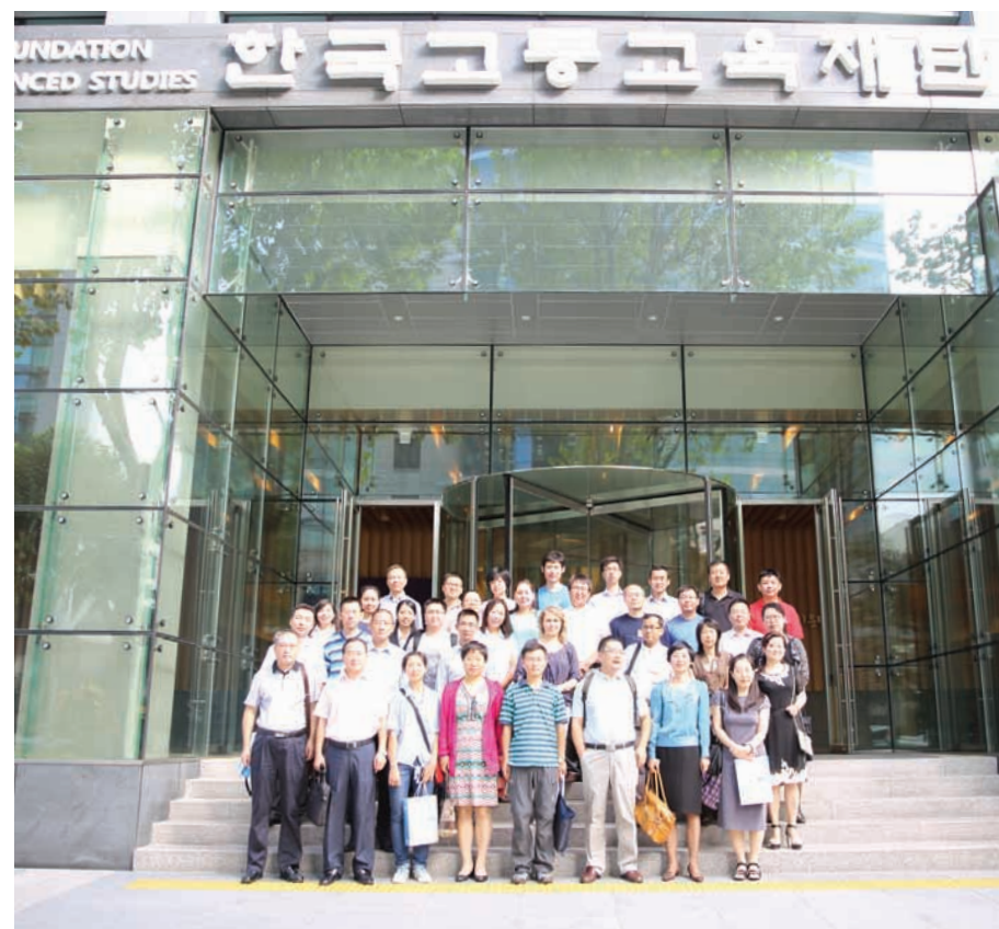
Arrival of the 2014-2015 ISEF Fellows

Thus, the ISEF Program has been implemented as a no-strings-attached research support program to help other countries make reciprocal and balanced advancements with Korea to prepare for the 21 st century when Asian countries are expected to play a prominent role in