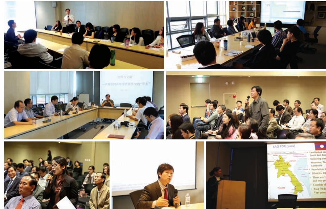
Academic seminars by ISEF fellows

However, if you belong to an ARC in China or belong to a country where an ARC is found (Cambodia, Laos, Mongolia, Myanmar, Thailand, Vietnam), you must submit the documents to the ARC. After an initial screening at ARCs, documents that belong to eligible applicants will then be sent to KFAS from the ARCs.