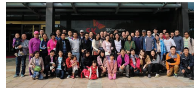
ISEF Fellows visit SK Energy Ulsan Complex