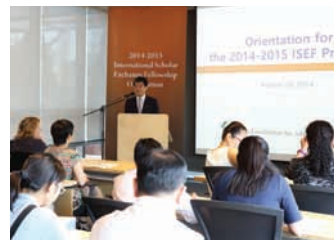
Orientation for the ISEF Fellows

Introduction of Korea Foundation for Advanced Studies _ 1