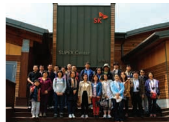
Visit to Afforestation Plant