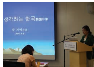
Korean Language Presentation