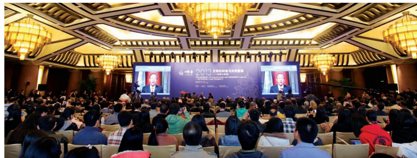
2013 Beijing Forum

The seventh Tumen River Forum was held at Yanbian University from October 11th, 2014 for two days under the theme, International