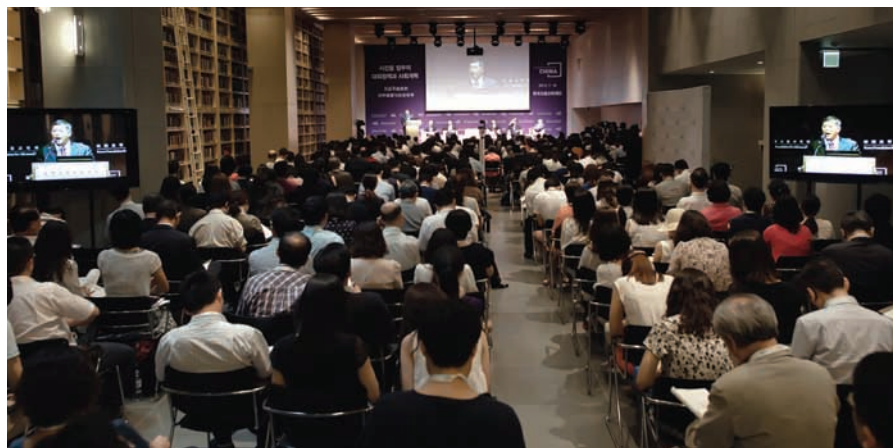
Main Conference Hall of KFAS