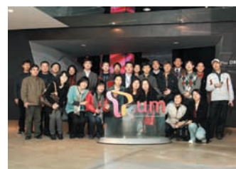
Visit to Research Institute