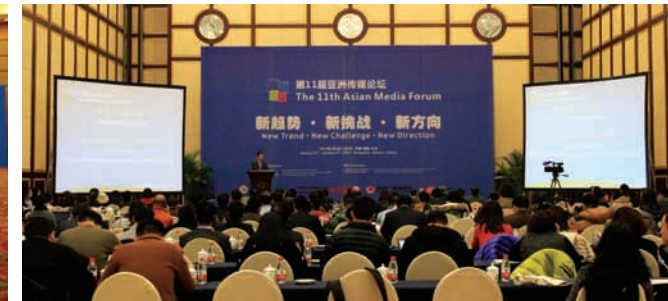
The 11th Asian Media Forum

Since 2003, KFAS has annually co-hosted Asian Media Forum with the Asia Media Research Center of Communication University of China in the field of journalism, communication, media industry