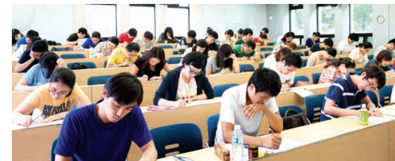
Examination for scholarship programs offered to Korean students