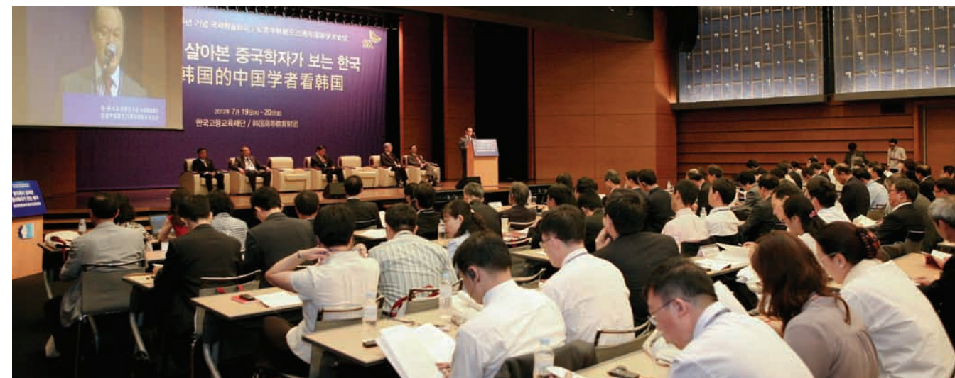
International Conference Commemorating the 20 Years of Korea-China Diplomatic Relations