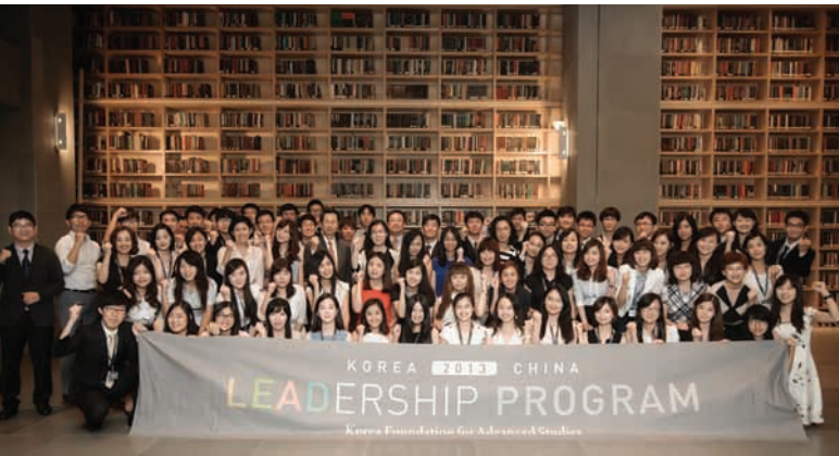
Korea-China LEADership Program

by KFAS alumni (former recipients of the KFAS Study Abroad Scholarship, who achieved PhDs from world's leading universities and the KFAS Domestic Scholarship program). Seventy-two KFAS alumni, who are prominent social leaders including university professors and researchers, have so far volunteered to be the speakers.