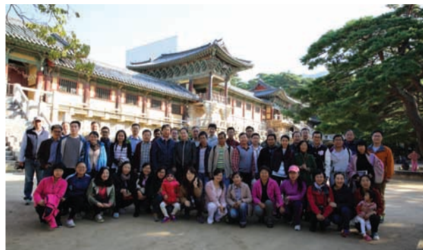
The first cultural trip for the 2014-2015 ISEF fellows

Asia Research Center Room No. 504, 5 th Fl., Headquarter Bld. 144 Xuan Thuy Rd., Cau Giay District Hanoi, Vietnam T. 844-37547987 E. arc@vnu.edu.vn http:// arc.vnu.edu.vn